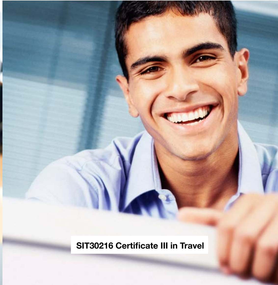
SIT30216 Certificate III in Travel