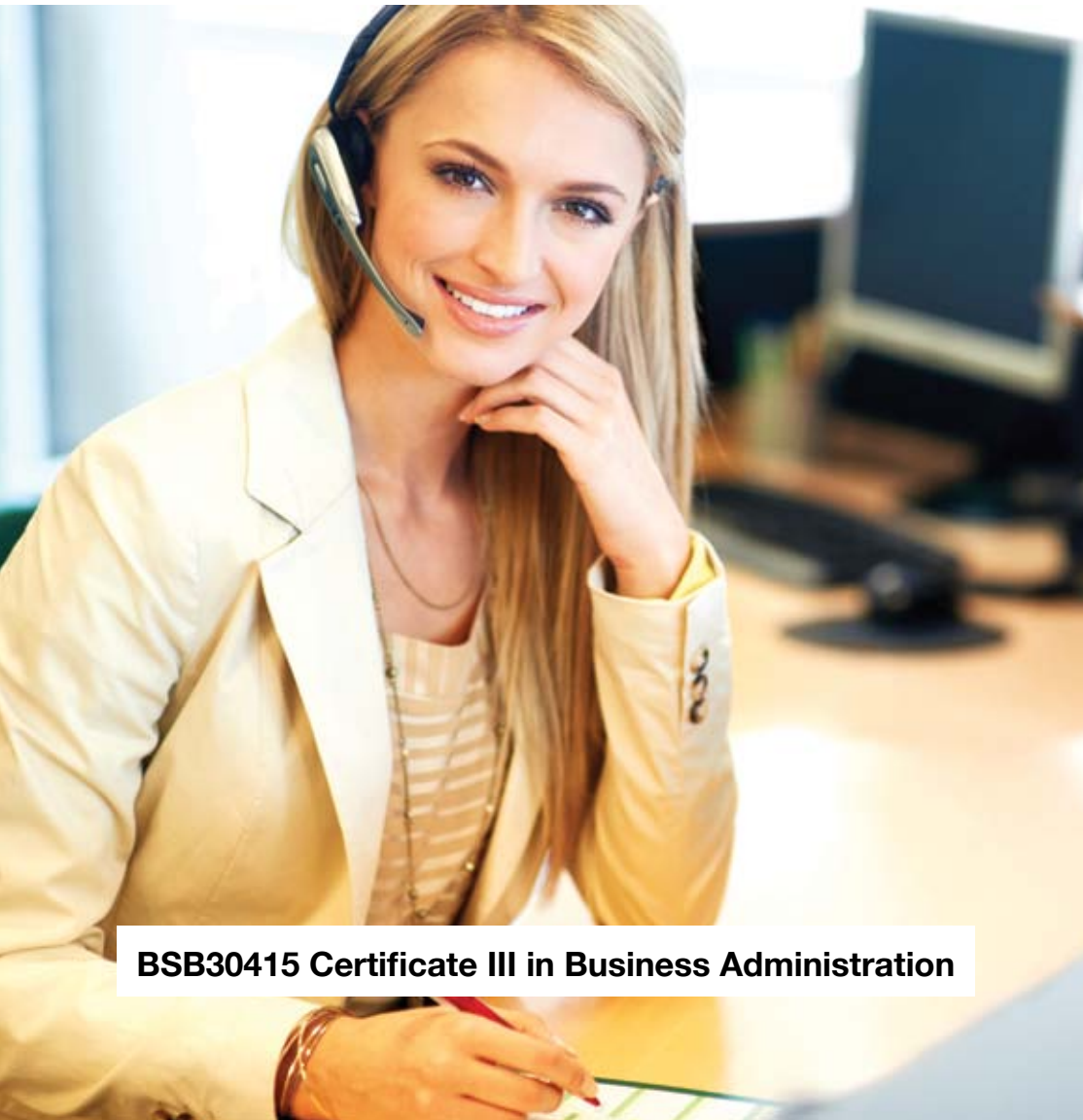
BSB30415 Certificate III in Business Administration

other nationally recognised courses available